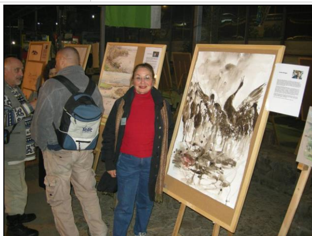
2011: Exhibition of the paintings from the Artists for Nature event in the Hula Valley