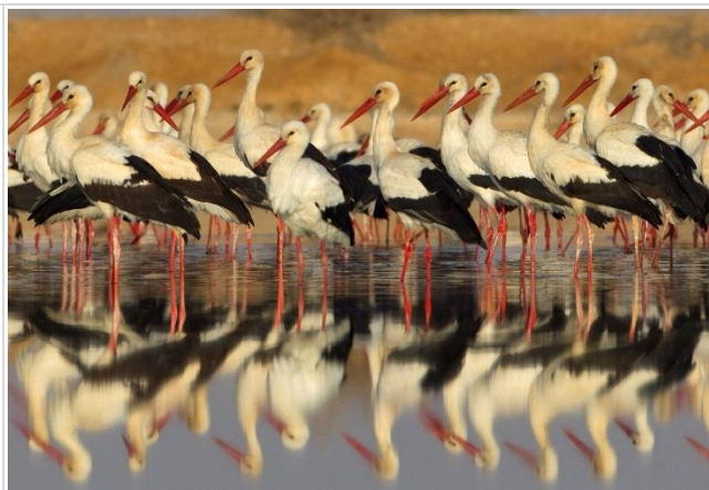
Migrating White Storks over Israel