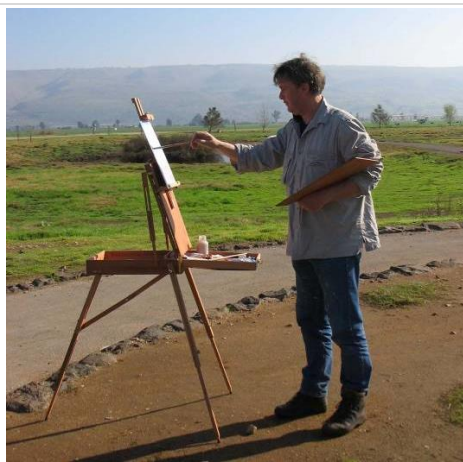
Artist at work during the Artists for Nature event in the Hula Valley