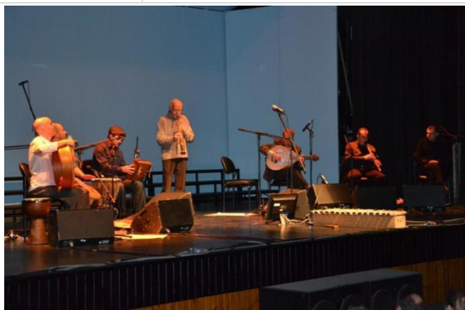
2011: Paul Winter and his Flyways Ensemble playing as part of the Artists for Nature event in the Hula Valley